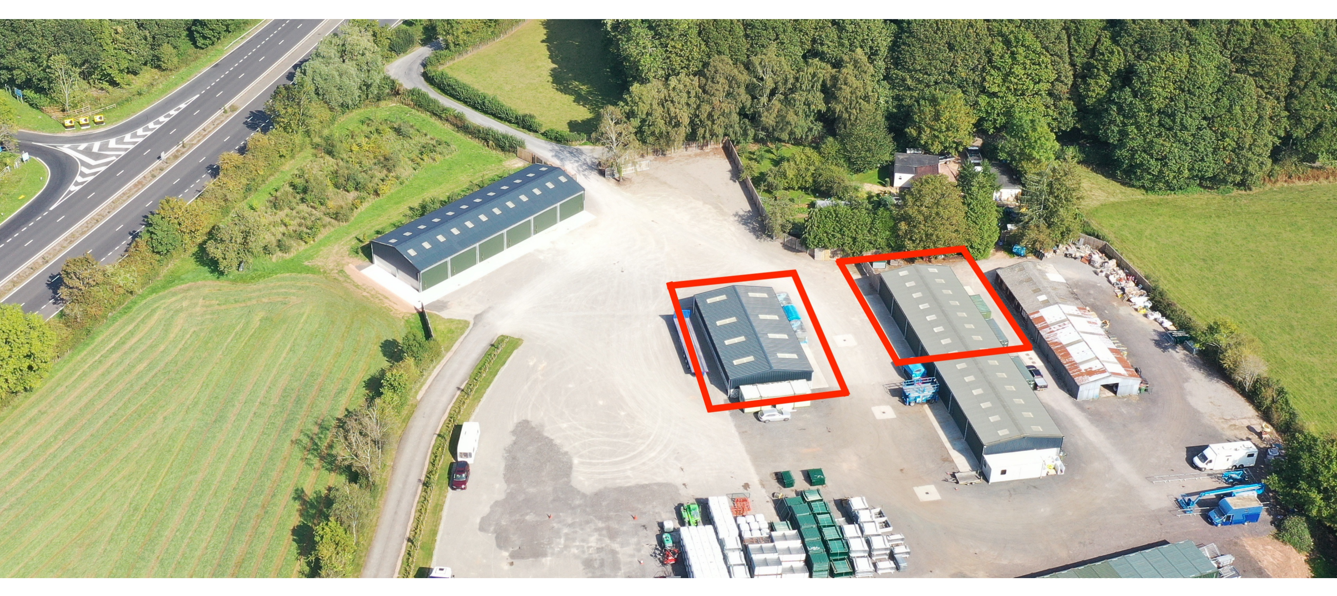
Homestead Business Park, Cothars Pitch, Gorsley, Ross-on-Wye, Herefordshire, HR9 7SE Excellent location directly adjacent J3 M50 Motorway