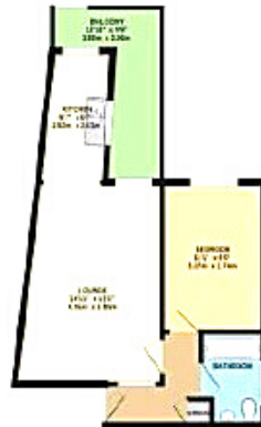
GROUND FLOOR 764 sq ft (70.7 sq m) approx

Whilst every effort has been made to ensure the accuracy of the floor area information, we do not warrant, represent or guarantee the accuracy of the information provided. The user should verify the accuracy of the information provided by independent means.