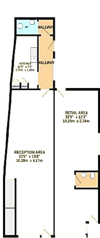
GROUND FLOOR 1039 sq ft (94.6 sq m) approx

TOTAL FLOOR AREA: 1039 sq ft (94.6 sq m) approx Whilst every effort has been made to ensure the accuracy of the floor area information, we do not warrant, represent or guarantee the accuracy of the information provided. The user should verify the accuracy of the information provided by independent means.