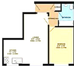
GROUND FLOOR 764 sq ft (70.7 sq m) approx

Whilst every effort has been made to ensure the accuracy of the floor area information, we do not warrant, represent or guarantee the accuracy of the information provided. The user should verify the accuracy of the information provided by independent means.