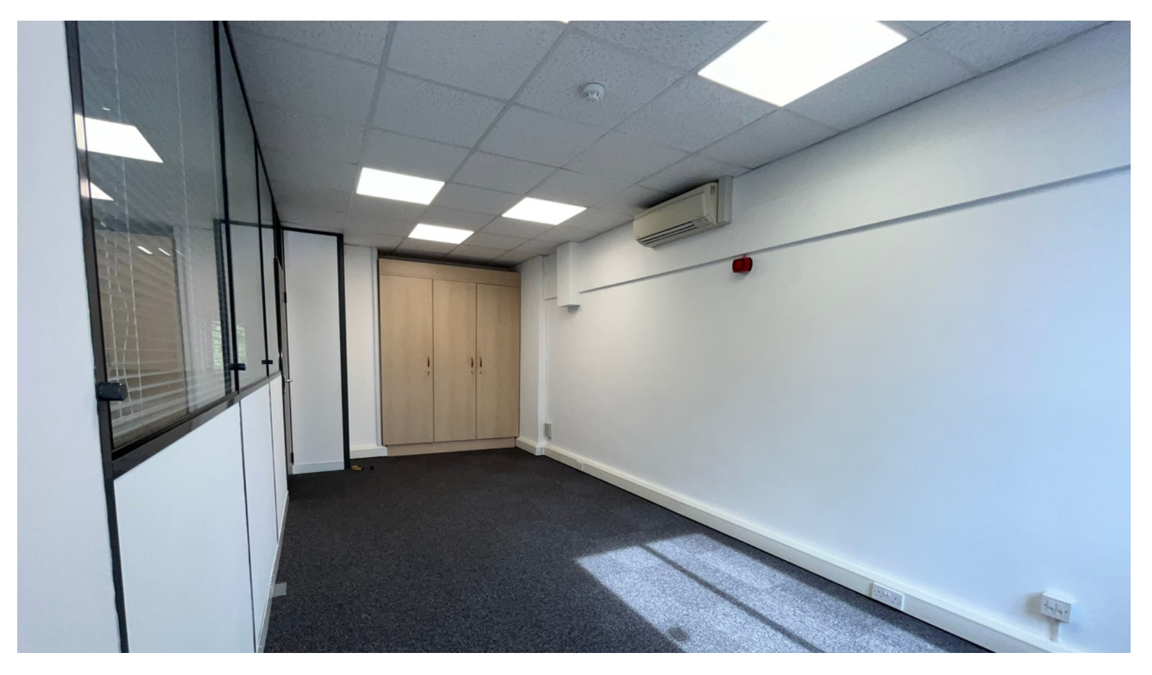
23, The Steadings Business Centre, Maisemore, Gloucester, GL2 8EY 5 minutes from Gloucester City Centre | Ground Floor | Ample on site parking