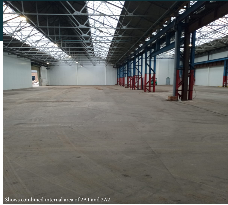
Shows combined internal area of 2A1 and 2A2

Historic industrial site re-invented for modern requirements. The site comprises industrial and office buildings.