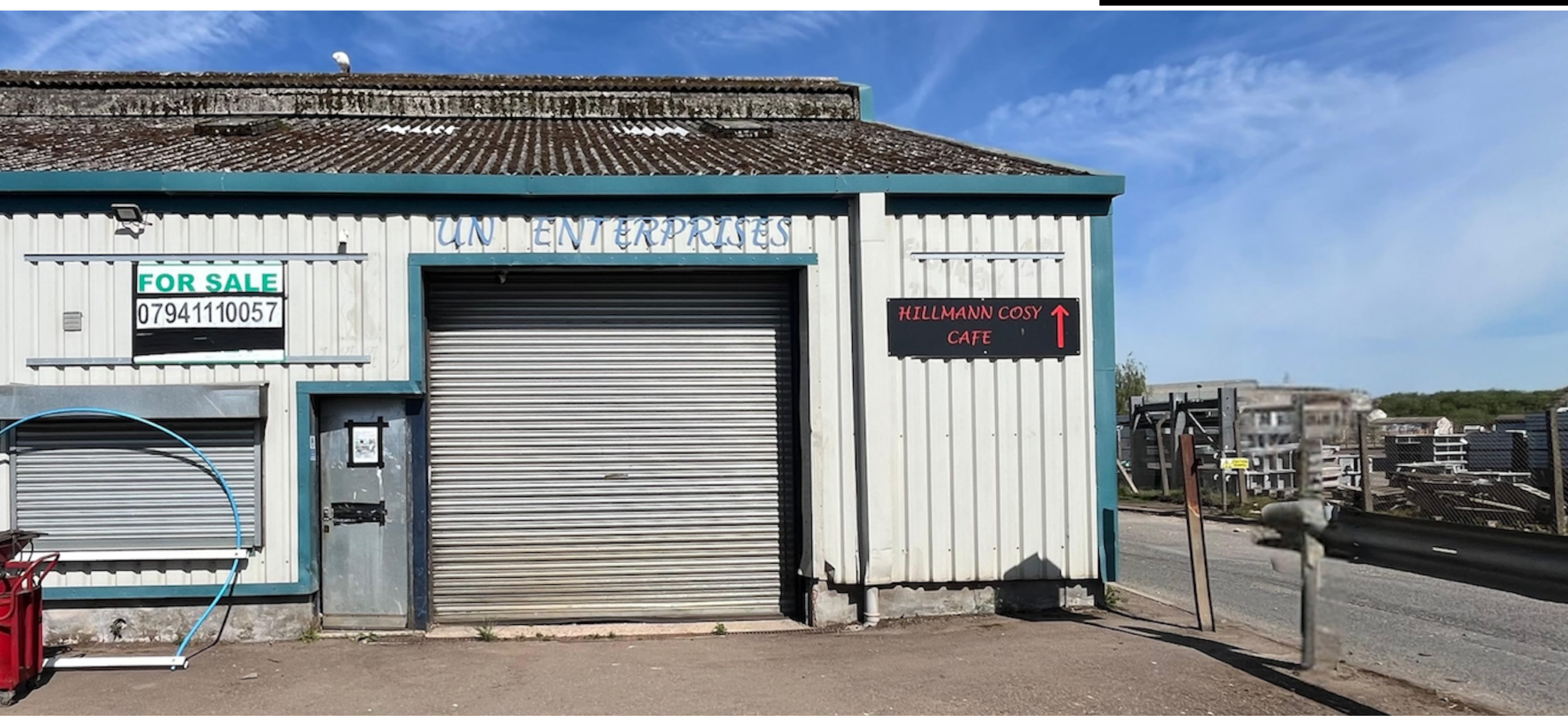
Unit 144J, Lydney Harbour Industrial Estate, Harbour Road, Lydney, GL15 4EJ Popular Trading Estate | Close to A48